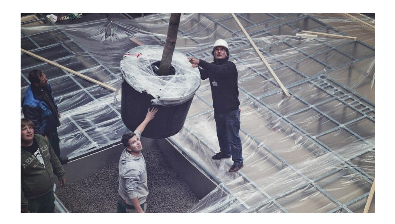
Site 2 of 2

If the entire project greening is not commissioned, will be invoiced to the customer as above shown.